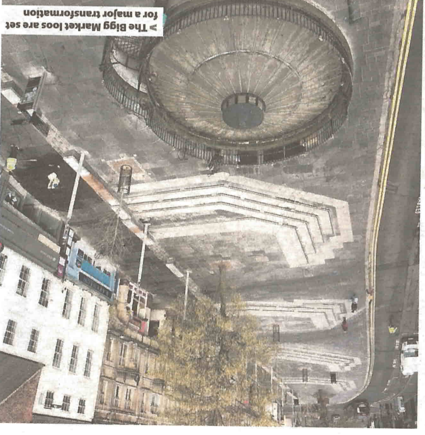
> The Bigg Market loos are set for a major transformation

The UK leaves the EU on 29 March 2019. To find out what it means for you, visit gov.uk/euexit